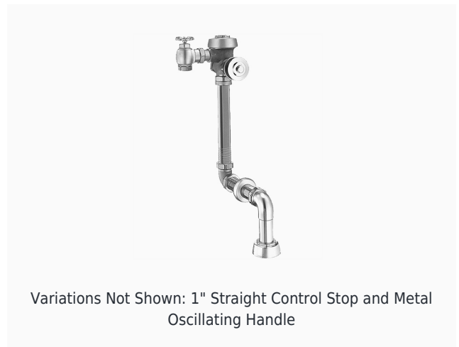
Variations Not Shown: 1" Straight Control Stop and Metal Oscillating Handle